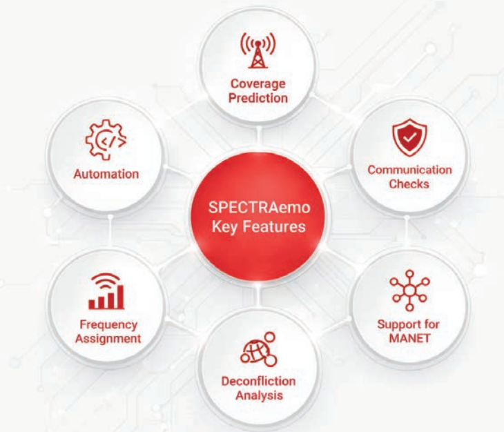
The diagram illustrates key functions of the launched SPECTRAemo software, including coverage prediction, spectrum deconfliction, communication checks, MANET support, frequency assignment and automation. Together, these capabilities enable defense planners to design resilient tactical radio networks, optimize spectrum usage and ensure reliable communications in complex operational environments.