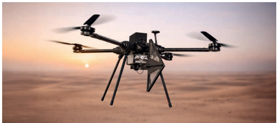
AMU-neo measurement drone

By linking mission planning with operational execution, SPECTRAemo enhances UAS performance, reduces mission risk, and supports effective electromagnetic operations. ■