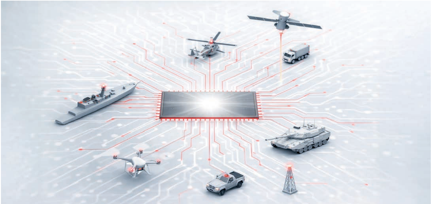
Coherent operational framework

By integrating data, systems, and decision support across all phases of Electromagnetic Spectrum Operations, LS telcom enables defense forces to secure operational freedom of action, where mission success depends on effective spectrum control, enabled by interoperable, standards-based integration with third-party and coalition systems. ■