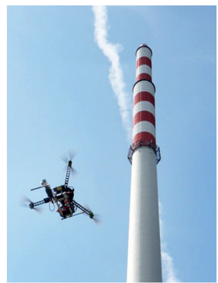
Drone-based broadcast measurements

the measured ASTC 3.0 performance of the network with the projected performance. By comparing the data sets, the network configuration and resulting IP throughput can be optimized thereby maximizing the value of the ATSC 3.0 operation.