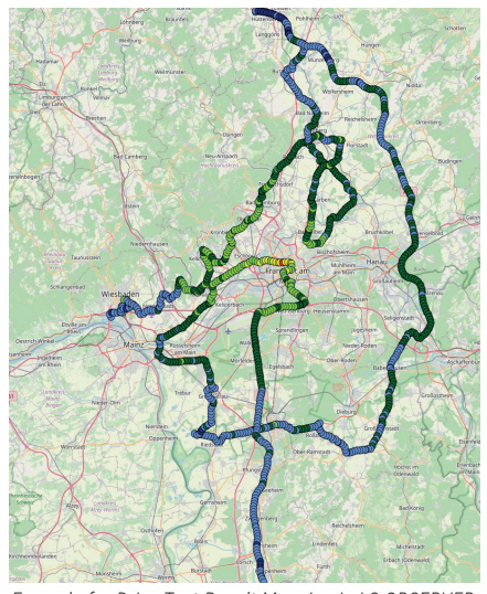
Example for Drive Test Result Mapping in LS OBSERVER

An important facet of this project was the LS OBSERVER system's capability to record everything consistently to its expansive local storage. The result was 60 GB of recorded data which covered the complete FM range. The extensive data garnered during the drive test was subjected to meticulous scrutiny using the Central Monitoring Software (CMS). This software not only visualized the field strength along the drive test route for both pre and post-antenna installation measurements but also allowed for a side-by-side comparison of the two. This comparative analysis was pivotal in evaluating the differences, highlighting areas of improvement, and ultimately determining the efficacy of the new antenna installation. Ensuring that the broadcasting spectrum provides optimal coverage is a challenge, especially in dynamic urban environments like Frankfurt. The recently conducted drive test provides invaluable insights into the broadcasting landscape.