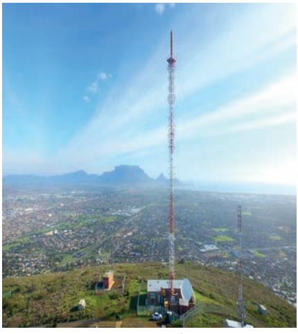
Sentech's Tygerberg transmitting facility

The collaborative team are now awaiting the outcome of a suitable trial license, which will have to be granted by the Independent Communications Authority of South Africa (ICASA).